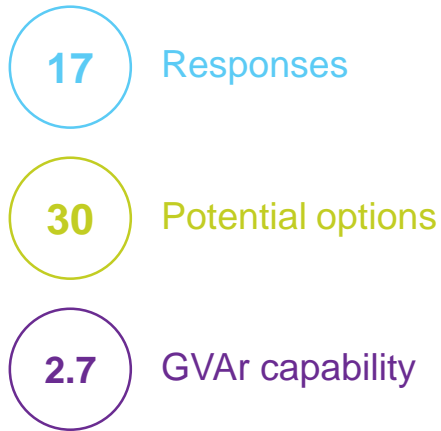
NUMBER OF OPTIONS BY ASSET TYPE

The RFI closed on 24 May. We have received responses from 17 potential providers.